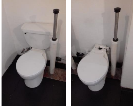
Figure 4. (a) Prototype ISMa.02.4, (b) Prototype ISMa.03.2.

installed. However, anyone with basic programming knowledge would be able to follow a tutorial for programming the controller. Prototypes with microprocessors are currently being tested with users (Figure 4).