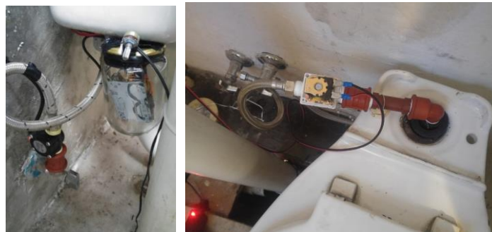
Figure 3. (a) Potentiometer incorporated, (b) Prototype with solenoid valve and no tank.

A second variation allows the water tank to be replaced by a solenoid valve using the water pressure directly from the pipe system (Figure 3b).