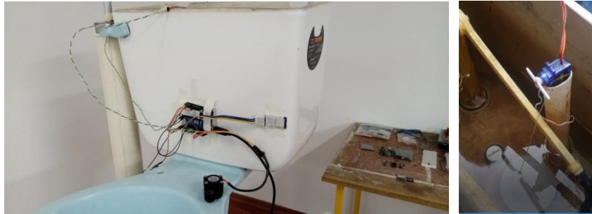
Figure 2. (a) Model with micro controller, (b) Servomotor.

blockage at the elevation of the valve of the tank, which produces loss of water. In addition, the implementation of the prototype revealed a potential malfunction due to a possible interaction with steam whenever the toilet was located near showers. In this scenario, the steam produced enough oxidation in some parts of the mechanism that would affect its performance. Therefore, the next iteration of the prototype would have to consider how to overcome the oxidation problem in both private and public scenarios.