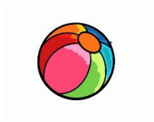
Table Furniture Wall Door Window toothbrush Refrigerator Air Conditioning Television Ball

Write the words from this vocabulary on their corresponding image. (10 points)